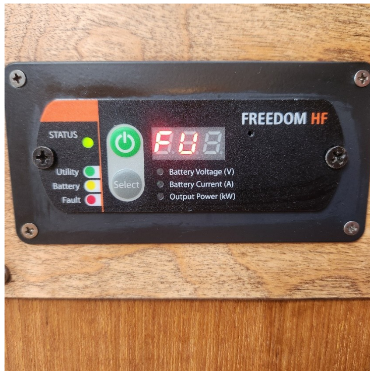
Inverter remote panel

Note - Inverter does not operate water heater, but please leave water heater in the off position while on inverter power. Inverter also does not power the cockpit ice maker or the heating/AC system.